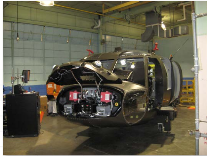
Black Hawk Aircrew Trainer under assembly at Kratos

Kratos Defense & Security Solutions, Inc. develops transformative, affordable technology for the Department of Defense and commercial customers. In addition to advanced training solutions and systems, Kratos specializes in unmanned systems, satellite communications, cyber security/warfare, microwave electronics, missile defense and combat systems.