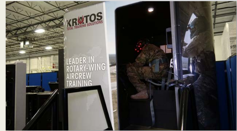
Mixed reality gunnery training in KATC

High-fidelity simulation systems can cost millions of dollars to own and sustain. When budget or process constraints prevent you from acquiring one, the same training excellence can be achieved by training on a variety of full-mission simulators in the Kratos Aircrew Training Center (KATC) .