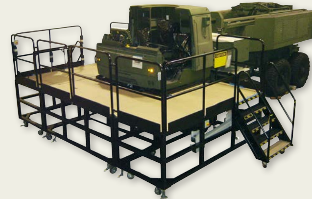
The HIMARS UFCS AMTS