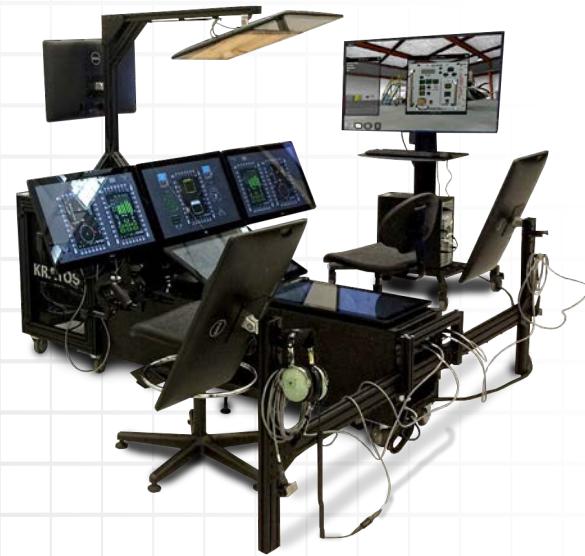
Maintenance Blended Reconfigurable Aviation Trainer (MBRAT)

Kratos Blended Training offers a unique combination of computer based training and replicated physical controls all within an immersive physical environment. This approach helps students advance along the training continuum by providing a cost effective bridge between computer-based training (CBT) and Part-or Full-Task trainers.