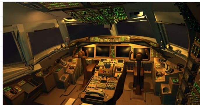
Aircrew Training System for the KC-46